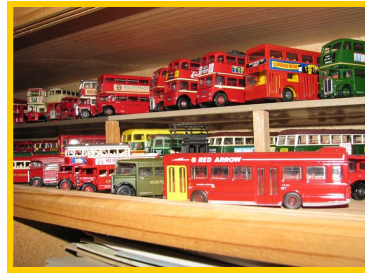
Fred collected more buses!

We have been learning a bit more French. Fred practised in France. Here with Greg in Aurillac at a festival!